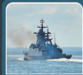
DEFENSE INDUSTRY CABLES