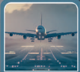
AIRFIELD LIGHTING CABLES